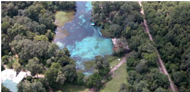
Rainbow Springs State Park

PLEASE NOTE: Hard hats, good field boots and safety vests are required to participate in the trip. Conference organizers cannot provide the necessary safety items. Bring rock hammers and sample collection bags as desired. Lunch and drinks will be provided.