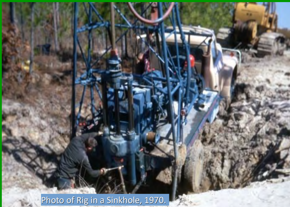
Photo of Rig in a Sinkhole, 1970.