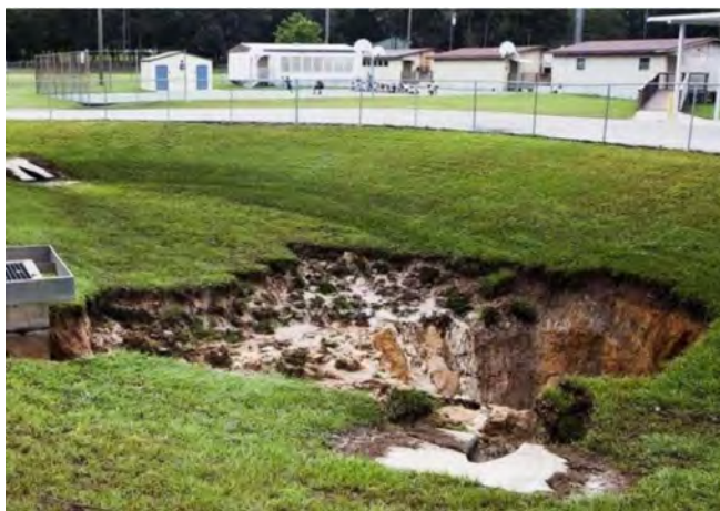
Improper stormwater designs can lead to future problems.