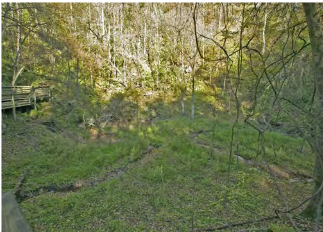
Devil's Millhopper Geological State Park

The first stop is at Devil's Millhopper Geological State Park north of Gainesville where participants can view the Devil's Millhopper, a large collapse sinkhole that penetrated from the Eocene Ocala Limestone through the Miocene Hawthorn Group and younger sediments.