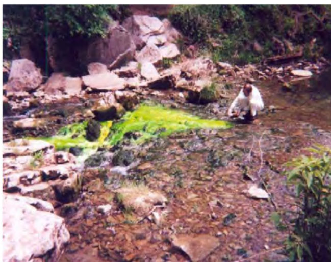
Introducing tracer is just one step in a successful trace.

Example Tests – Recent and historical tracing examples will be examined in detail, offering a wide range of karst settings in which tracing has been successfully used. In these examples the hydrogeology demonstrated by the tracing will be compared to the hydrogeology inferred by traditional well data.